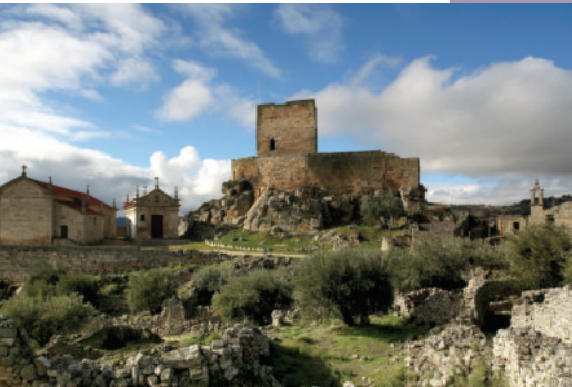
Donjon, Santiago Church and Senhor dos Passos Chapel