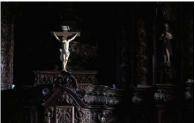
S. Pedro Church, 17 th century Murals and magnificent baroque altars in gilded wood

The church was designed in Manueline and baroque style and boasts unpainted mannerist and King João-style retables.