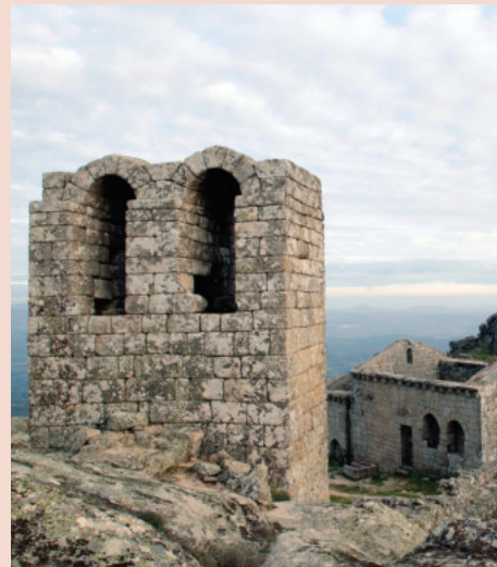
Bell tower and S. Miguel Chapel (on the way out from the walls)

From the bastion, a starting and finishing point for adventurers, you come to the village that gradually grew up here from the 15 th century onwards after abandoning the old settlement around the castle at the top of the hill. Walk around this village, with its characteristic inselbergs, one of the monuments of the UNESCO Naturtejo Geopark, and through its landscapes to interpret Earth's history.