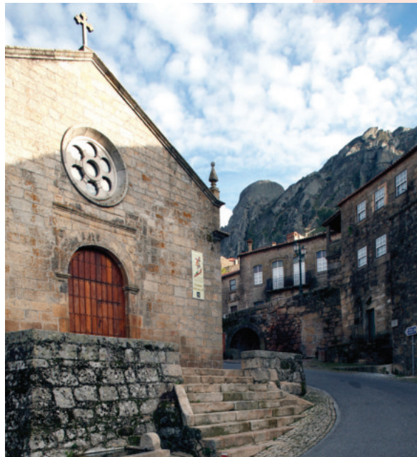
Parish Church or S. Salvador Church It has an 18 th century façade while its construction probably dates back to the 15 th century.

The oldest part is also the highest point, where the Knights Templar built a wall with the donjon.