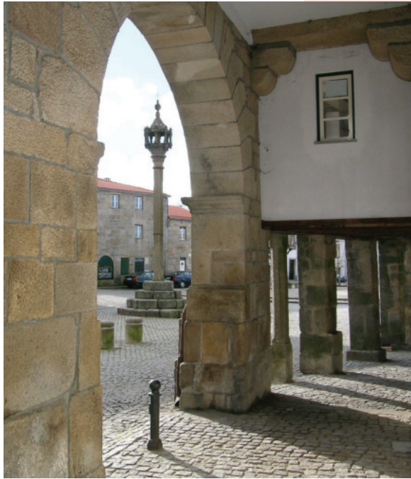
2 Praça D. Dinis square It has always been the town's nerve centre, and boasts a pillory and the S. Pedro and Misericórdia Churches.

Visiting Trancoso is reliving Portugal's history. Today's peace and quiet in its centuries-old castle contrast with the alarms and fears experienced by people of other times. It was a border town, the stage for fights and battles that were decisive to the formation and independence of the kingdom. Cherished by kings, it received important privileges. King Afonso Henriques granted it a municipal charter and King Afonso III a fair charter. King Dinis commissioned the construction of the walls that still protect a town where Christians and Jews lived side by side.