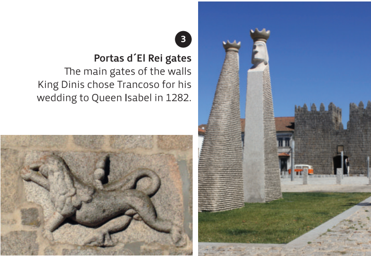
3 Portas d’El Rei gates The main gates of the walls King Dinis chose Trancoso for his wedding to Queen Isabel in 1282.