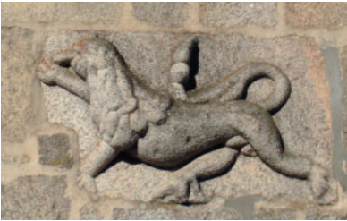
20 Lion of Judah This was one of the motifs of the decoration of the synagogue. It is in the main façade of Gato Preto House.