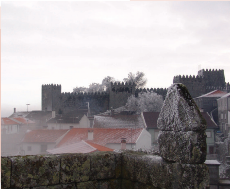
1 Trancoso Castle From here you have a stunning view of Riba-Côa.